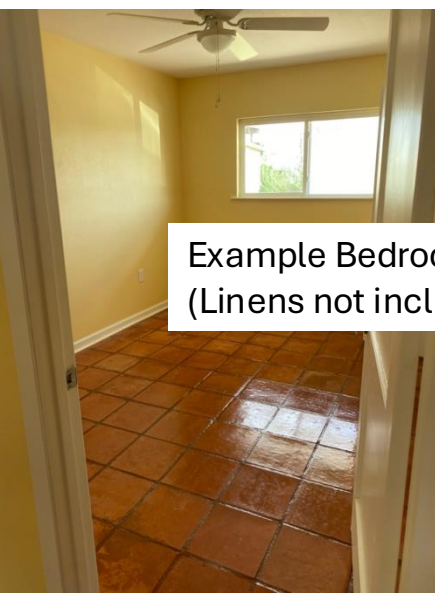
Example Bedroom (Linens not included)